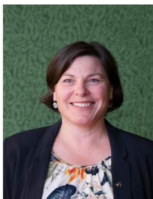
Mayor - Charlotte Bisset

We are confident this budget represents both a fiscally-responsible approach to managing Council, but also one which reflects community sentiment and need and will help us make significant progress in delivering our Council Plan.