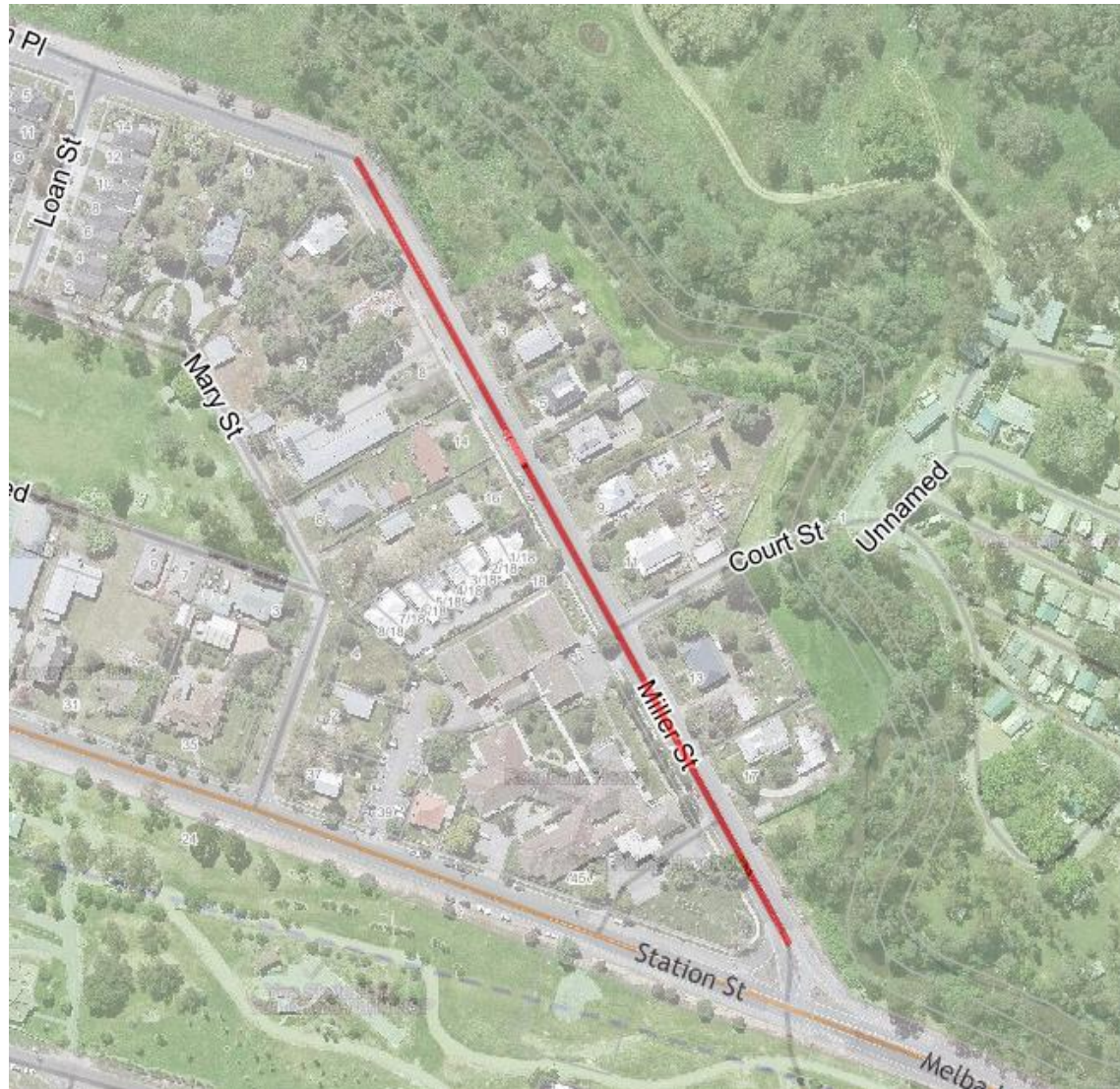
Segments: 129, 494 & 495 – Miller St, Yea Chainage: Melba Hwy – Whatton PI