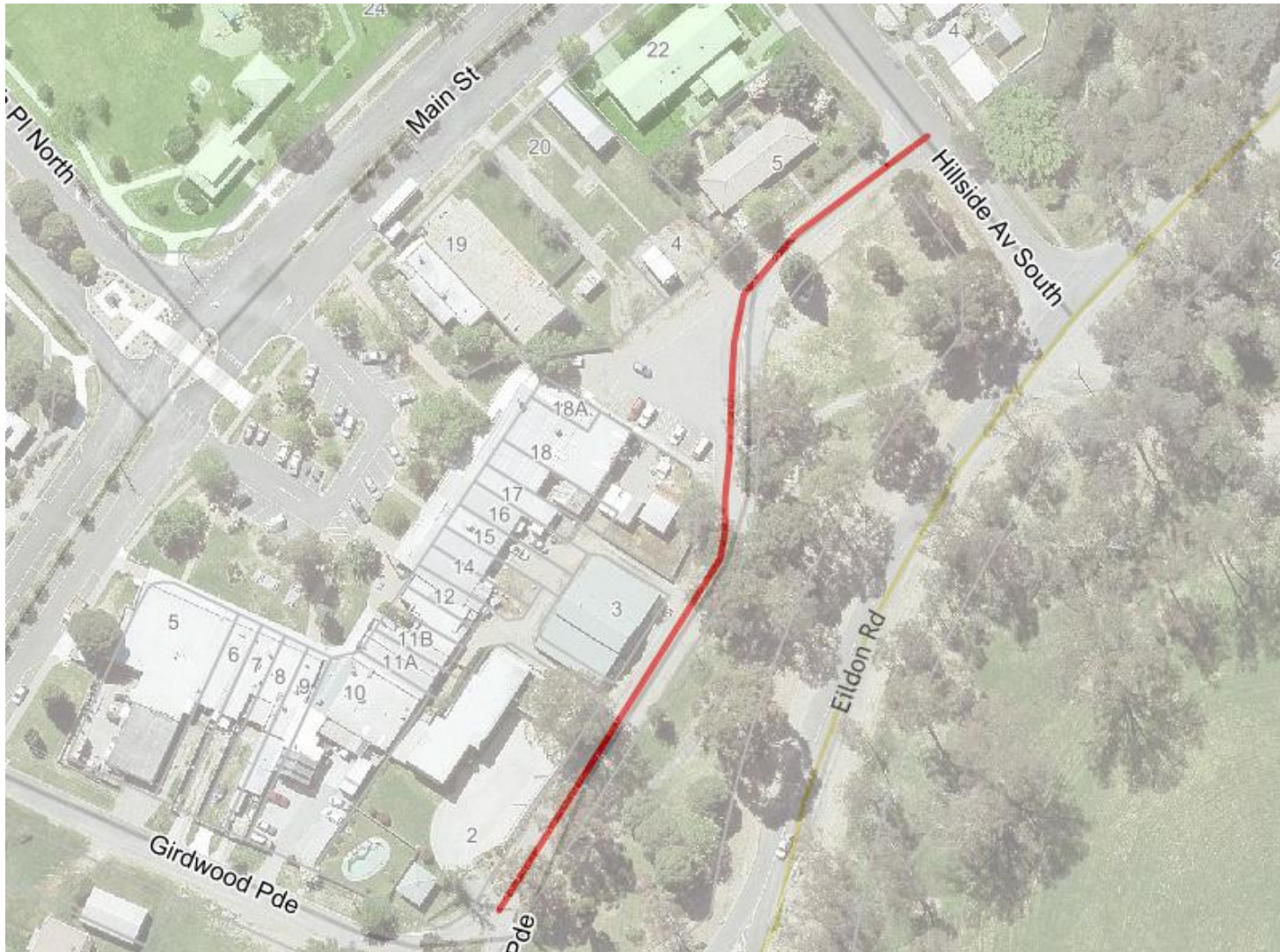
Segment: 250 – Girdwood Pde, Eildon Chainage: 0m Hillside Ave South – 180 m