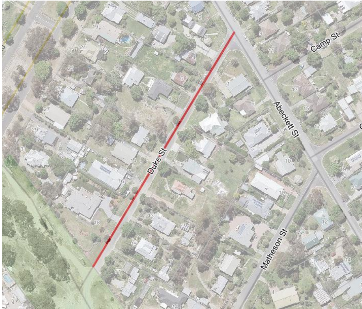
Segment 151 – Duke St, Yea Chainage: 0m Abeckett St – 222m