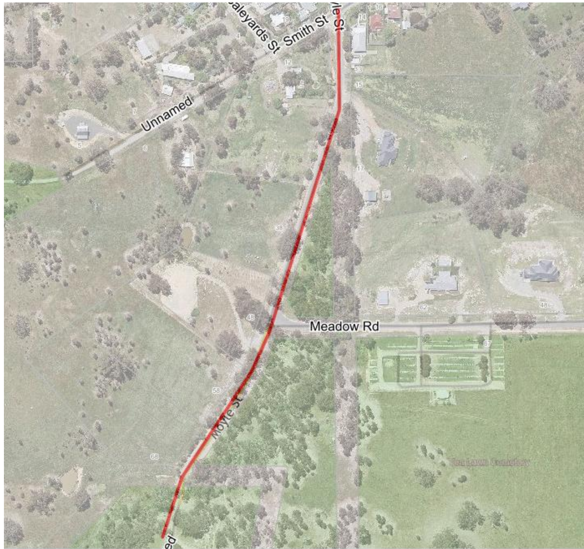
Segments: 507 & 508 - Moyle St, Yea Chainage: 0m Smith St - 785m