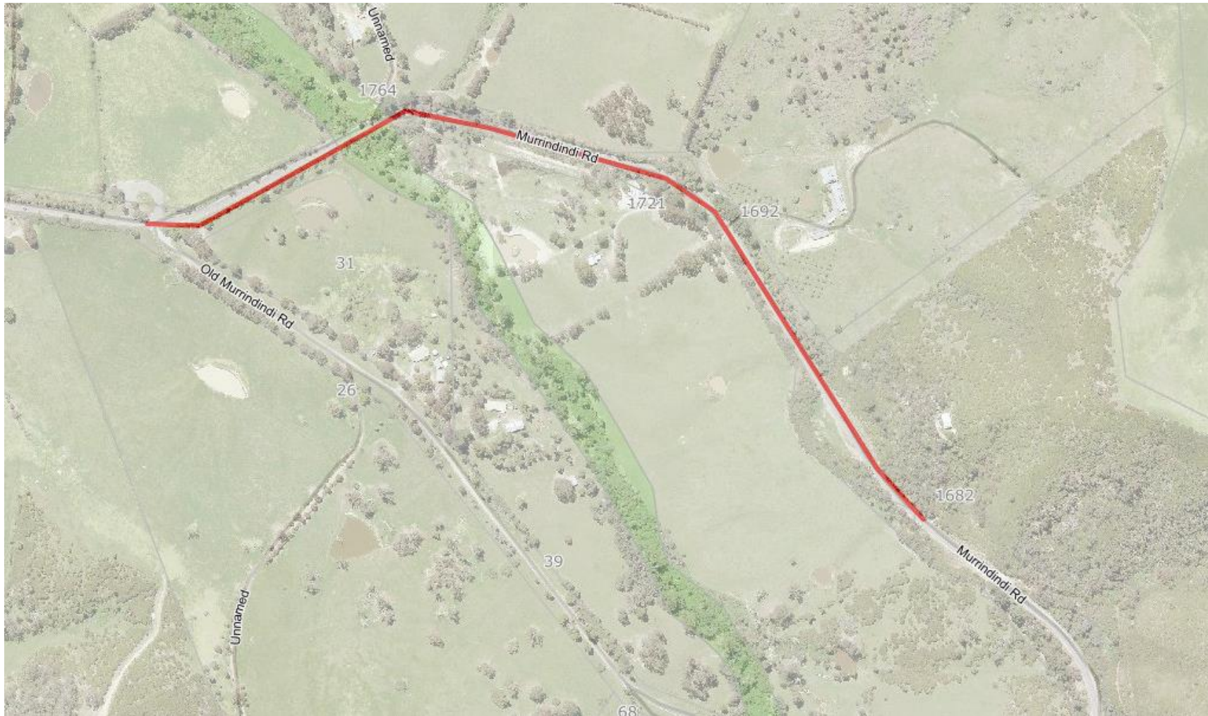
Segment: 521 – Murrindindi Rd, Murrindindi Chainage: 0 m Old Murrindindi Rd – 1,040m