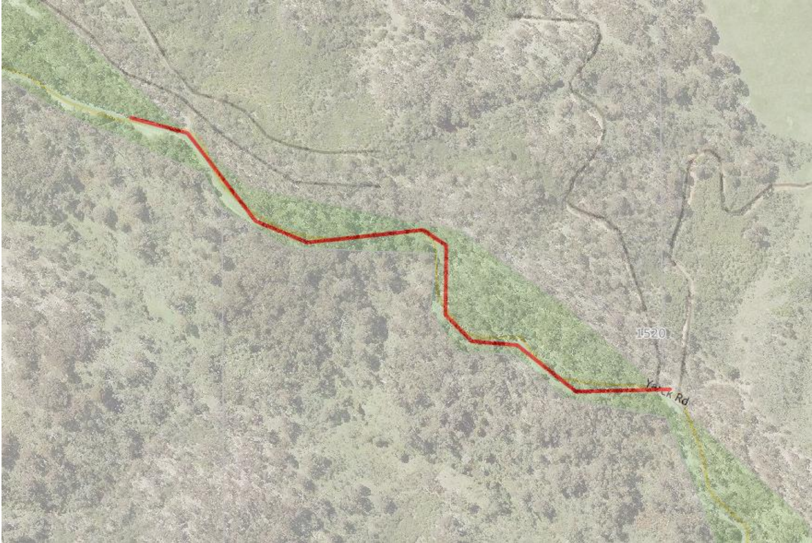
Segment: 878 – Yarck Rd, Gobur Chainage: 15,185m from Maroondah Hwy – 16,065m