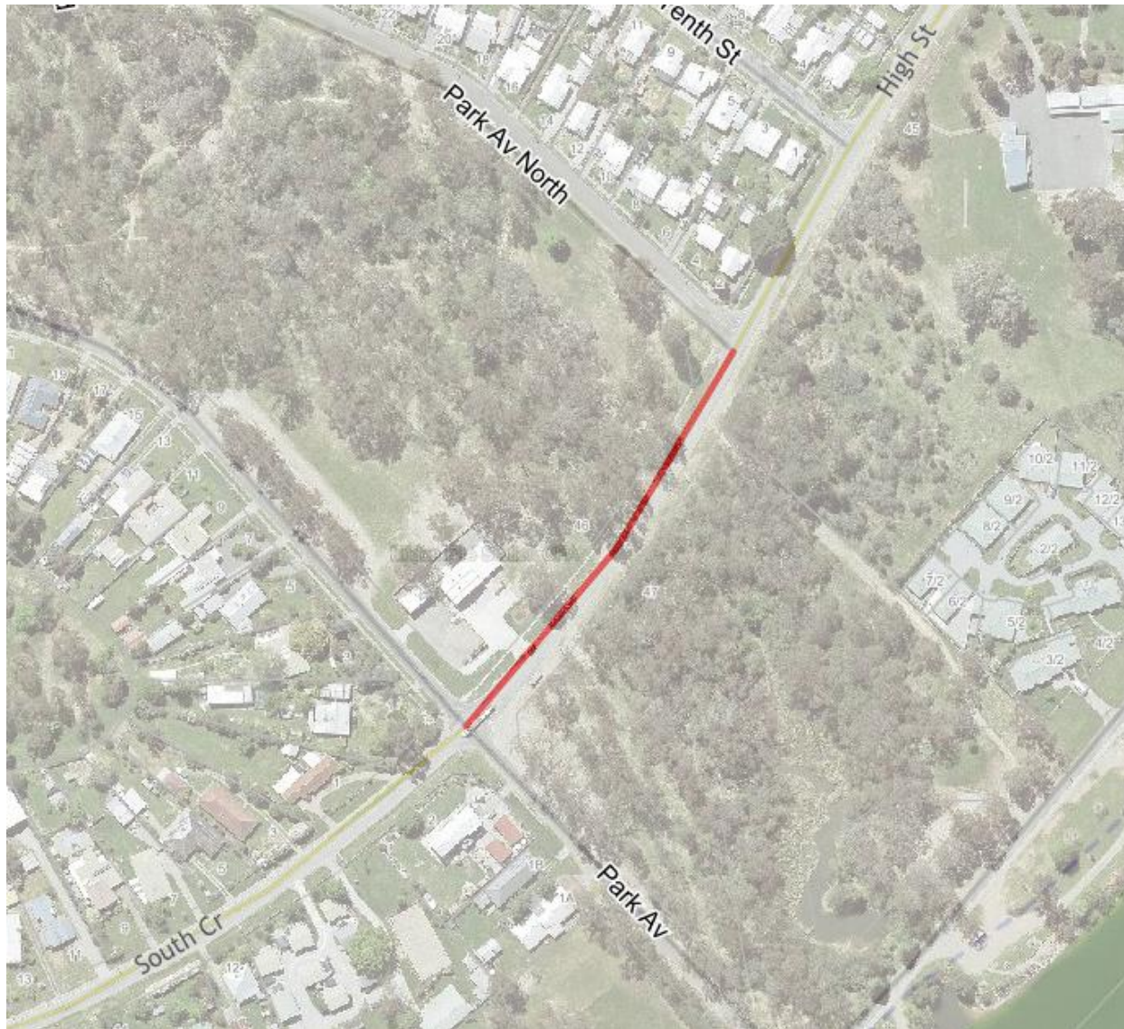
Segment: 289 – High St, Eildon Chainage: 0m Park Av – 211m Park Ave North