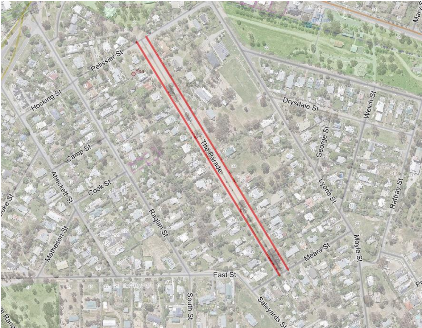
Segments: 759 & 760 – The Parade, Yea Chainage: 0m Pelissier St – Meara St