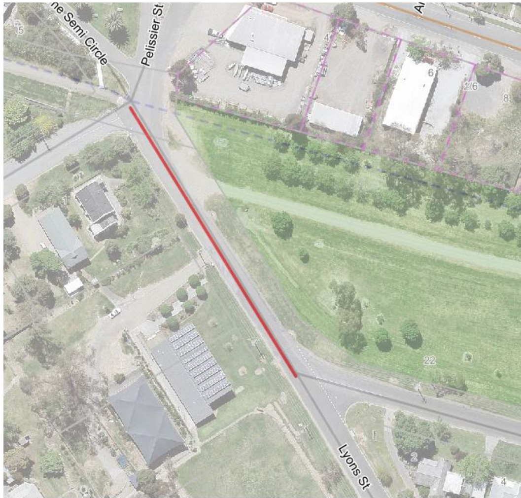
Segment: 428 – Lyons St, Yea Chainage: 00 Pelissier St – Oliver St