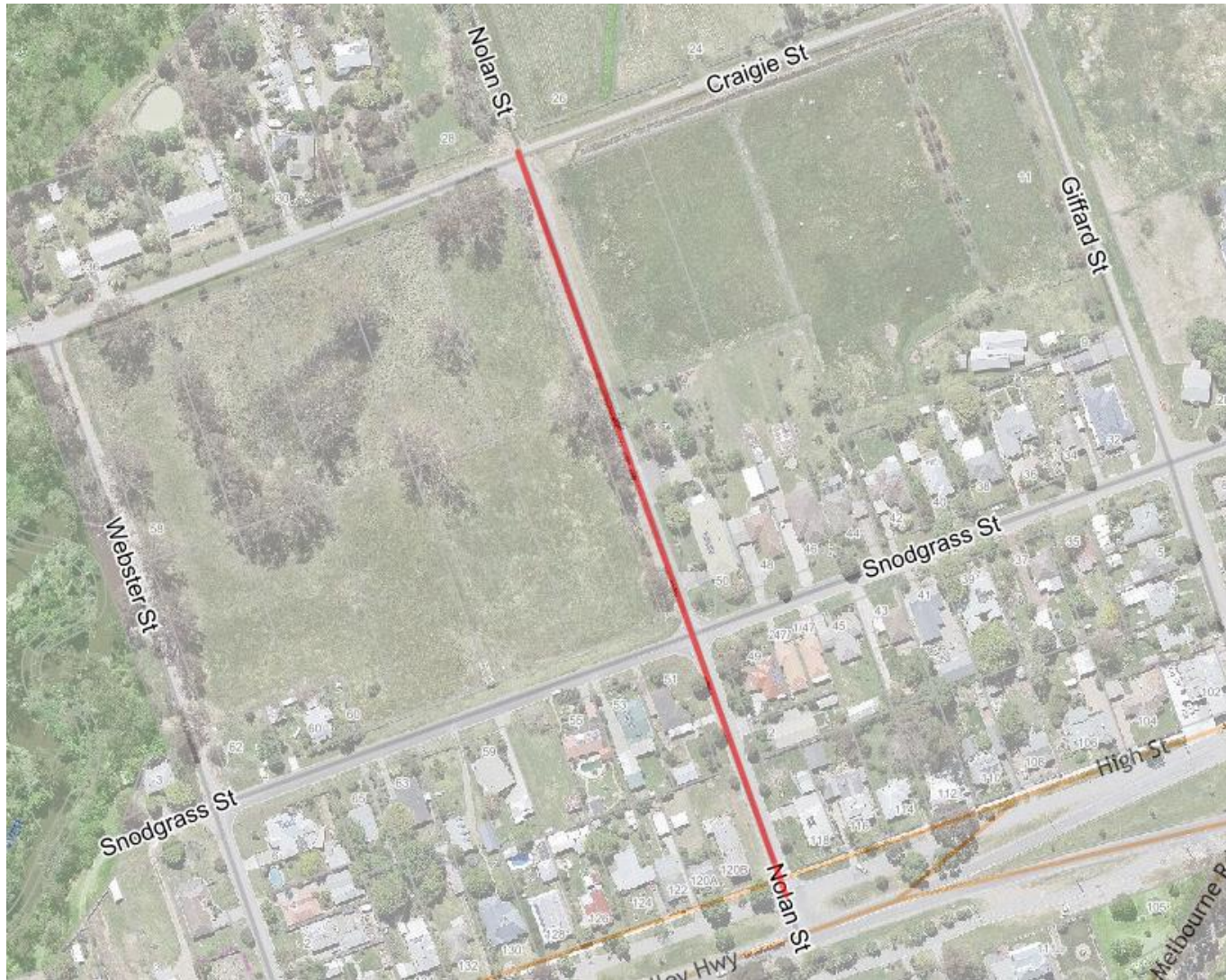
Segments: 569 & 570 - Nolan St, Yea Chainage: 0m High St – Craigie St