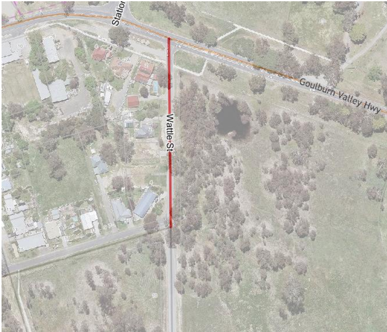
Segment: 826 – Wattle St, Alexandra Chainage: 0m Goulburn Valley Hwy – 160m Nihil St