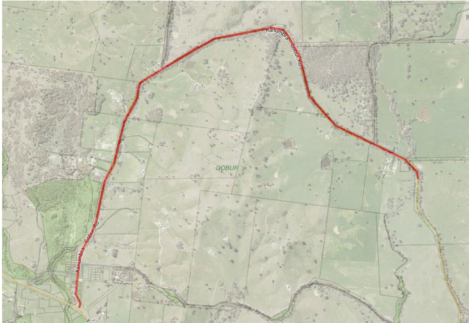
Segments: 359 & 360 – Kanumbra-Gobur Rd, Yarck Chainage: 00 Yarck Rd – 4,835m