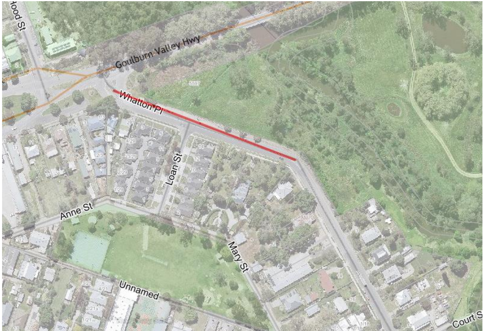
Segment: 859 –Whatton Place, Yea Chainage: 0m Goulburn Valley Hwy – 177m Miller St