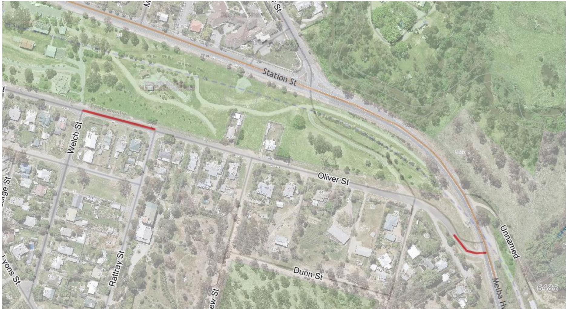
Segments: 454 & 576 - Oliver St, Yea Chainage: 0m Melba Hwy – 65 m & Rattray St – Welch St