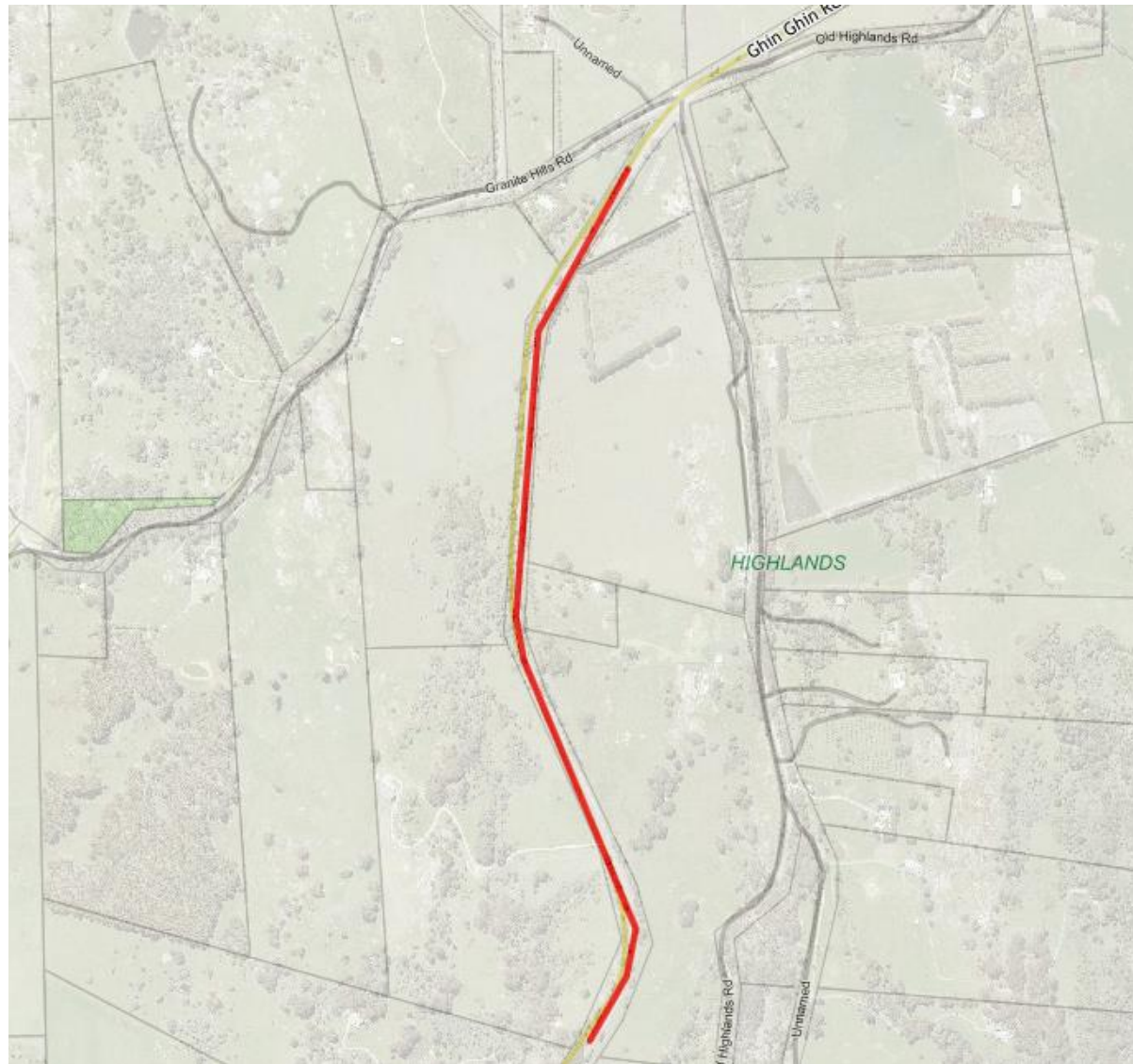
Segment 2791 – Ghin Ghin Rd, Highlands Chainage: 13,260 m from Goulburn Valley Hwy – 14,790 m