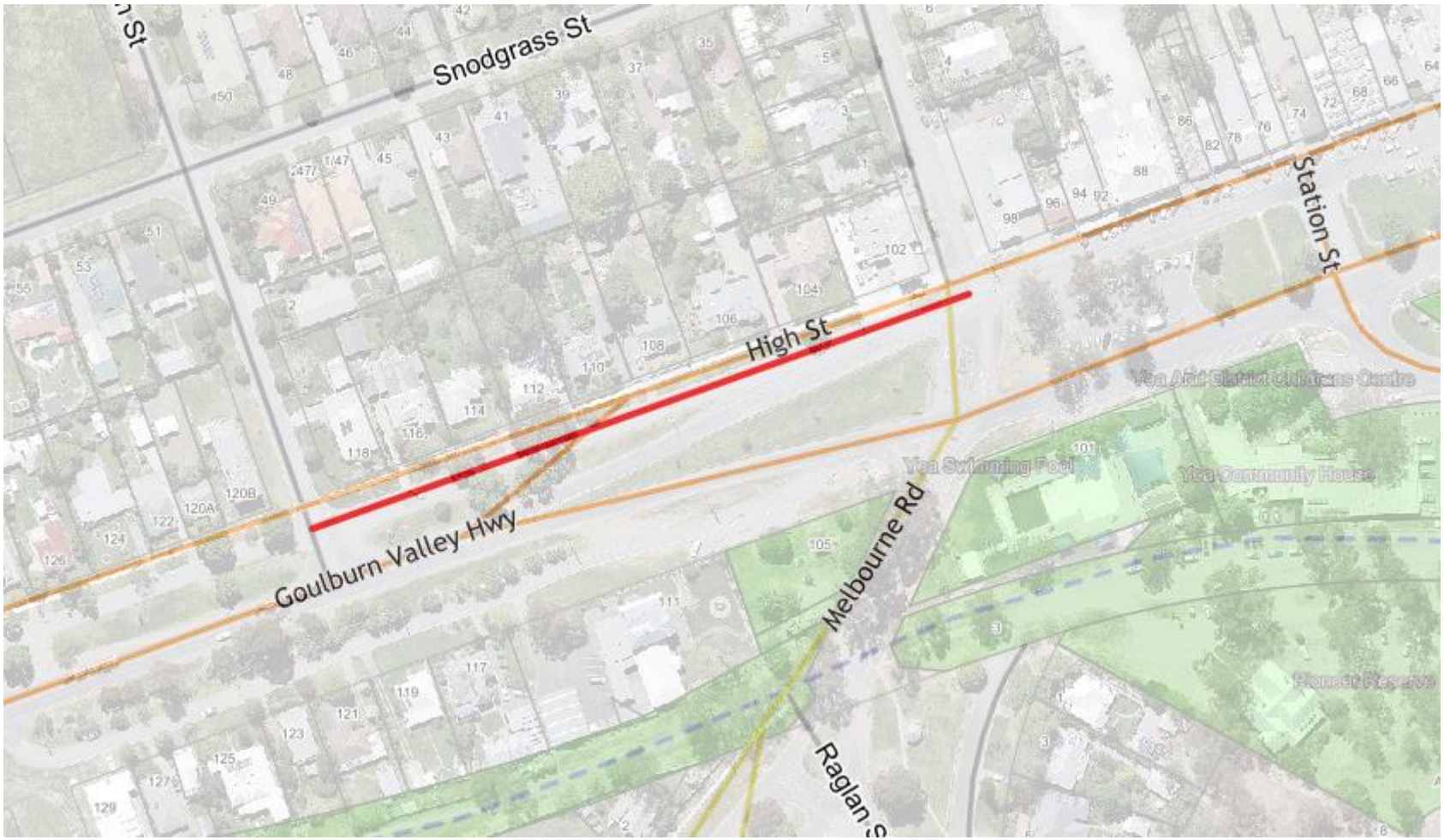
Segment 307 – High St, Yea Chainage: Nolan St – Giffard St