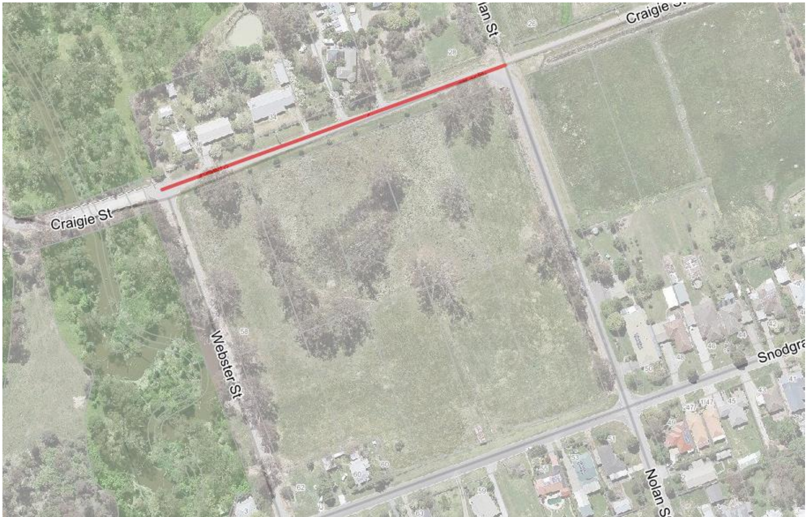
Segment 130 – Craigie St, Yea Chainage: Webster St – Nolan St