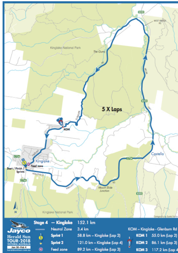
Stage 4 — Kinglake 152.1 km