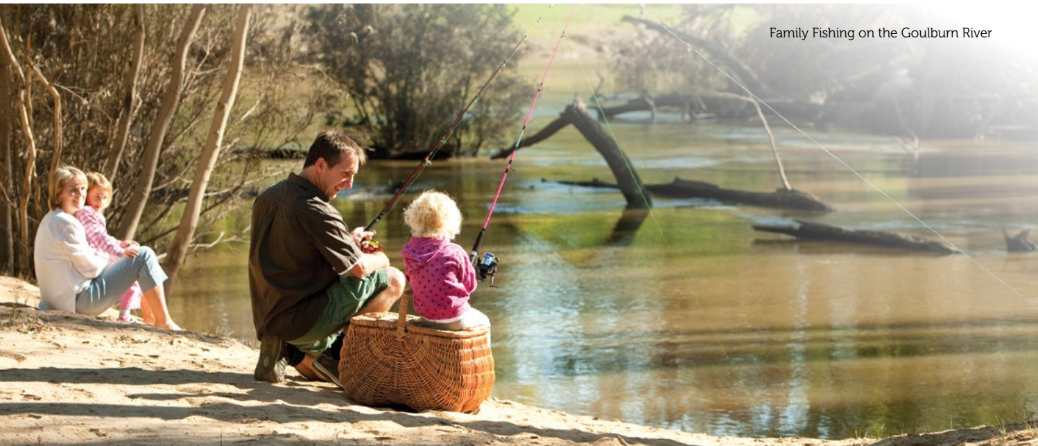
Family Fishing on the Goulburn River