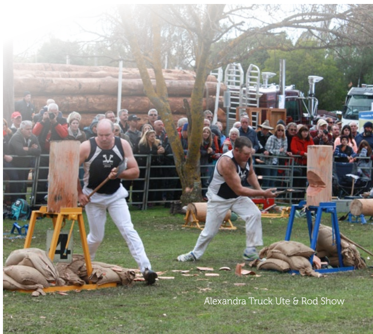
Alexandra Truck Ute & Rod Show

www.lakemountainresort.com.au admin@lakemountainresort.com.au 03 5957 7201