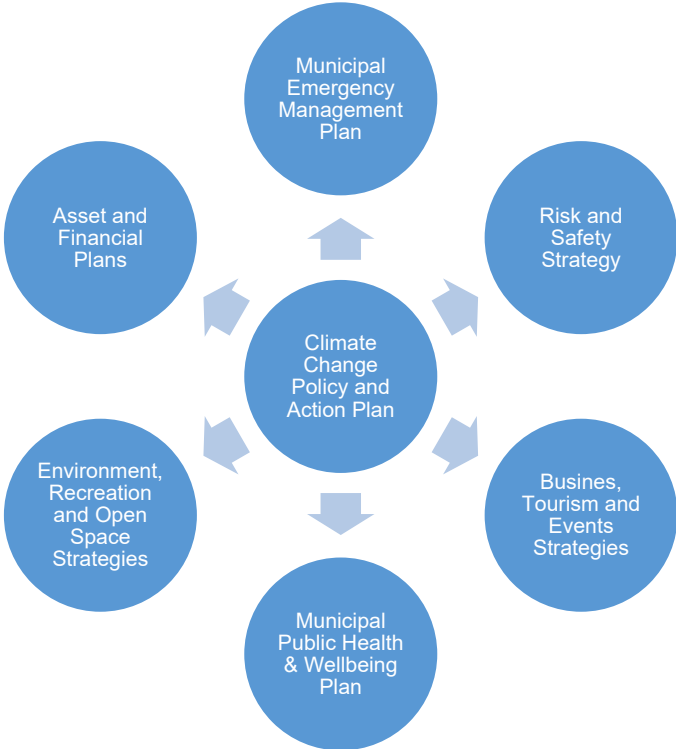
Figure 2: The framework to plan for climate change