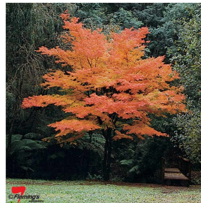
Acer palmatum ( Polymorphum ) - Japanese Maple or similar small cultivar 4 x 4m