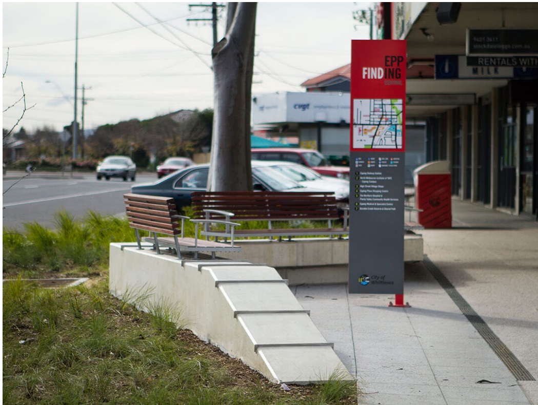
Custom furniture for small break-out seating areas in the streetscape examples