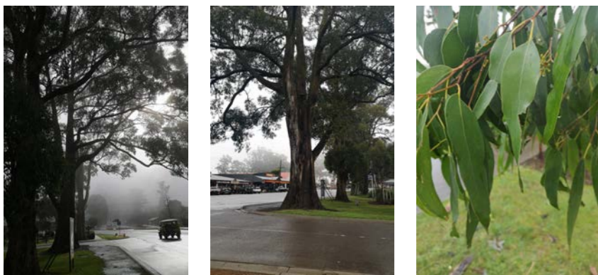
Existing Eucalyptus sp. Trees