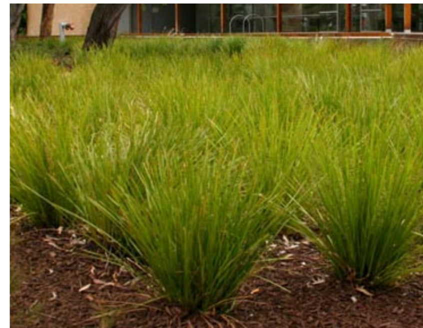
Mass planting garden beds