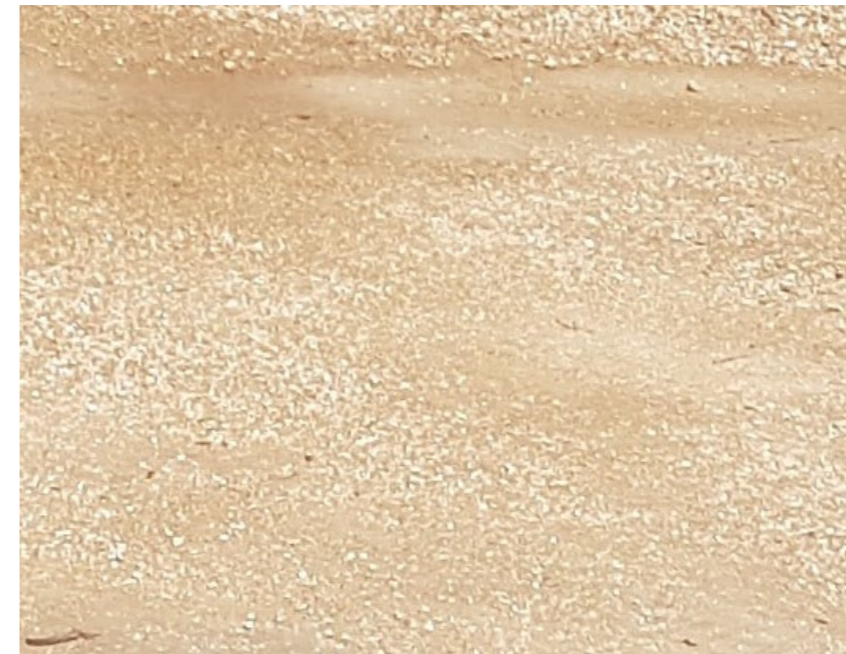
Compacted granitic sand