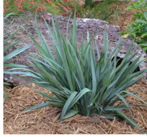
Strappy Leaf / Grasses