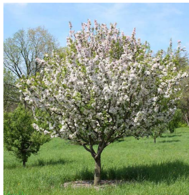
Malus spectabilis 'Plena' - Crab Apple 5 x 3m