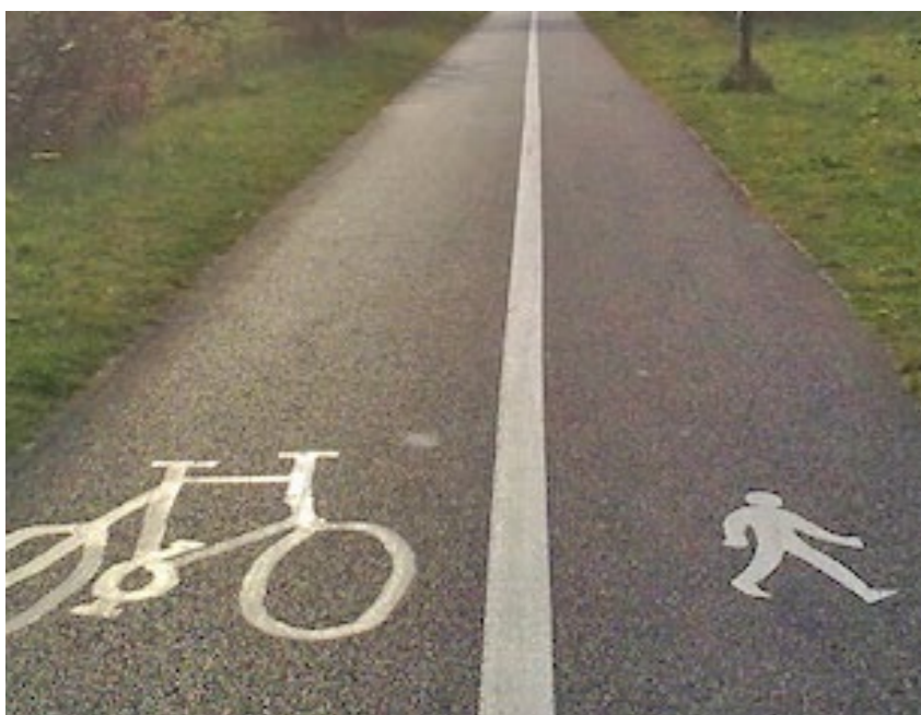
Asphalt shared path surface