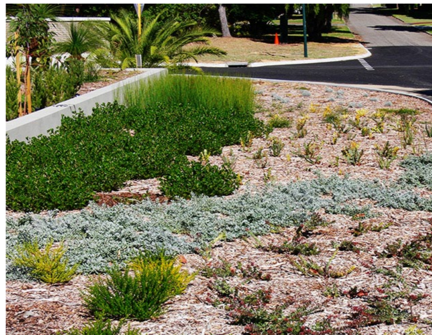
Mixed planting garden beds