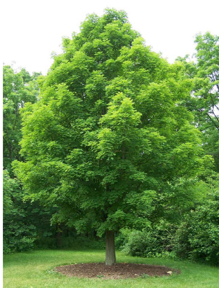
Acer saccharum - Sugar maple 12 x 10m Spring / summer