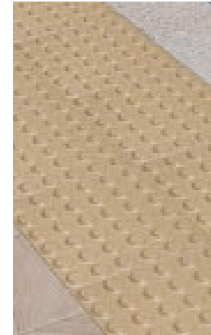
Tactile indicators - ceramic or rubber options