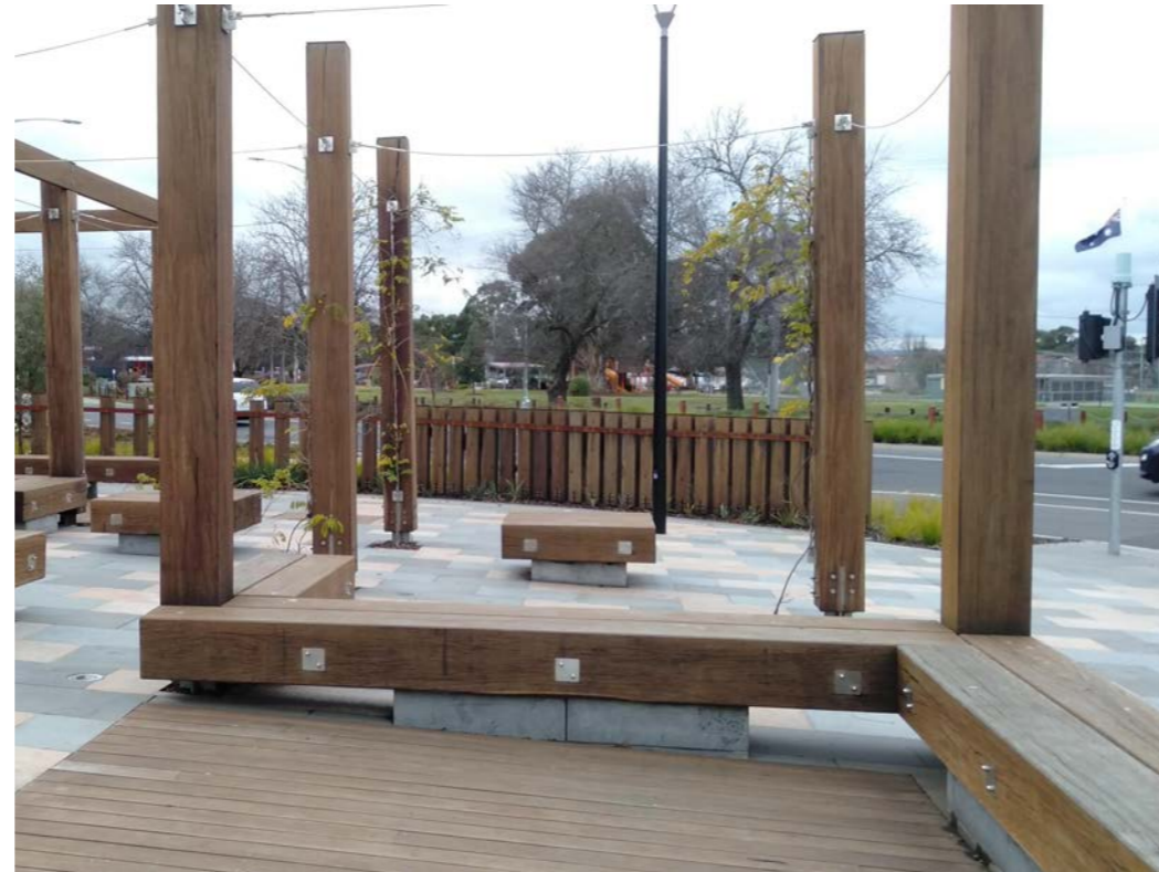
Plaza with large timber features