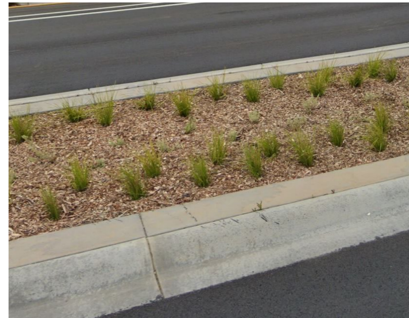
Concrete maintenance edge along median