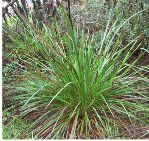
WSUD Strappy Leaf / Grasses