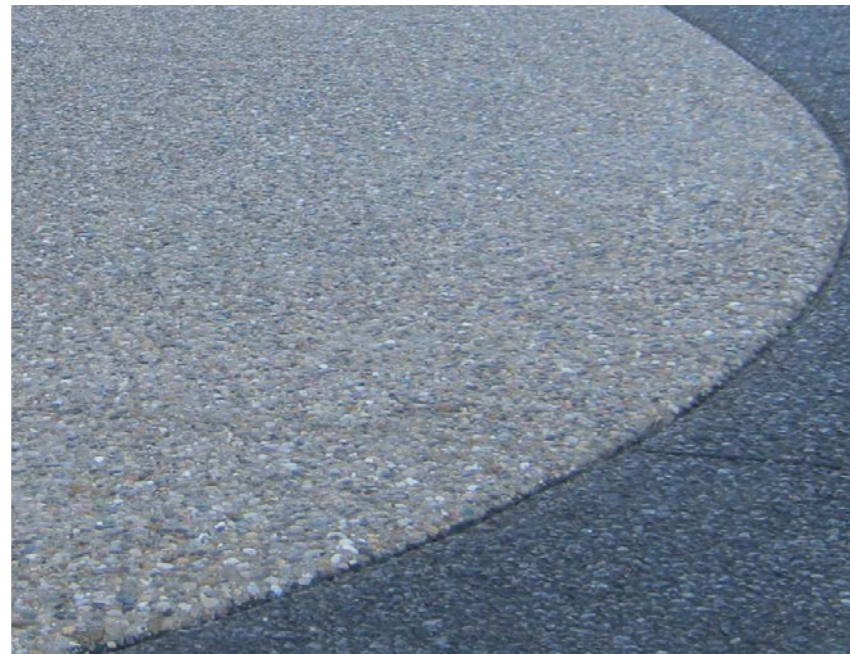
Contrasting exposed aggregate concrete colours