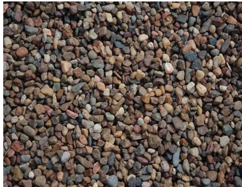
7 - 10mm Pebble mulch