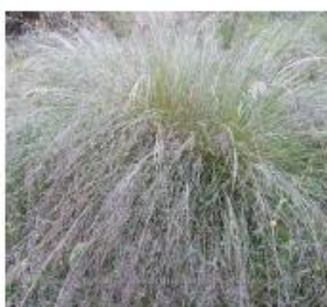
Low shrubs <600mm