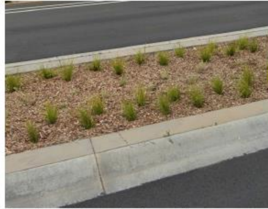
Concrete maintenance edge along median