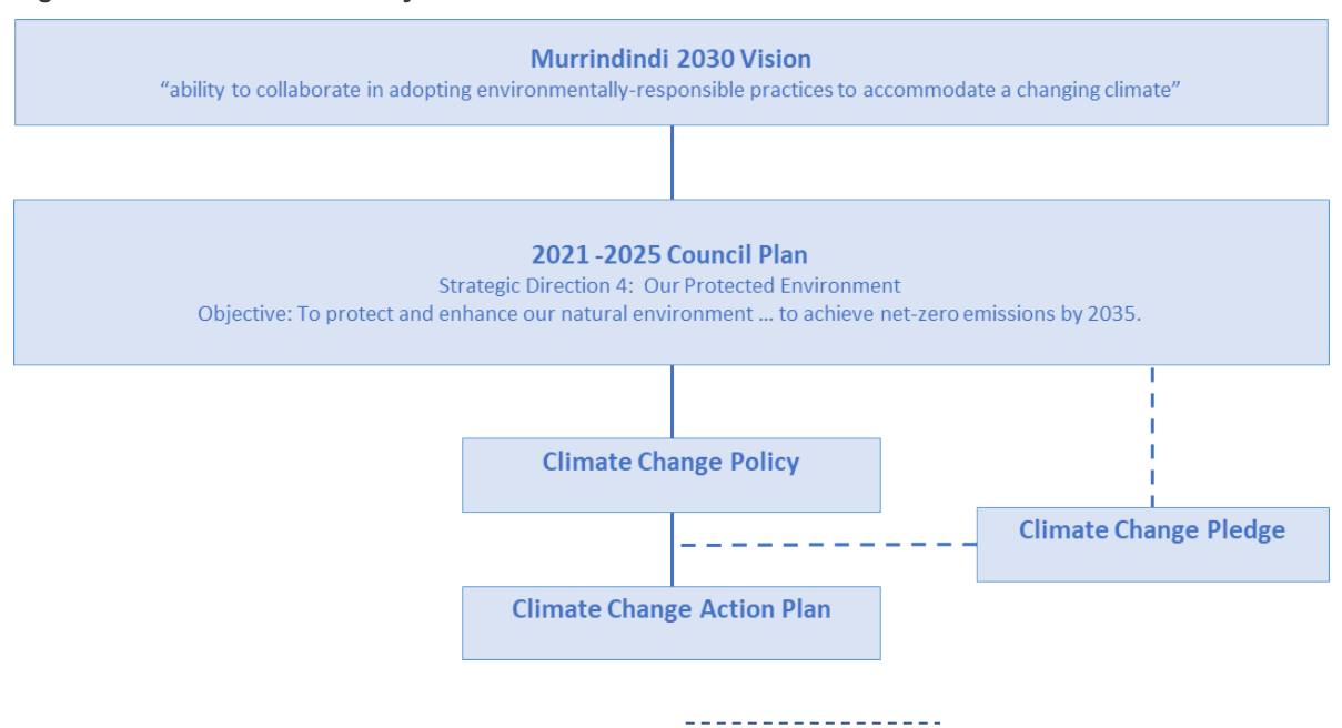
Figure 1: Governance Hierarchy

This document delivers against the 2021/2022 Council Plan Action 4.3.7 'Develop a Climate Change Policy'. It sits within the organisation's governance hierarchy as follows: