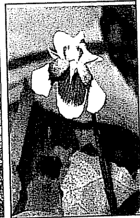
Ivy leaf Violet

YOUR CHANCE TO BE INVOLVED IN EXCITING COMMUNITY ACTIVITIES