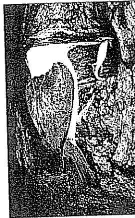
Sacred Kingfisher