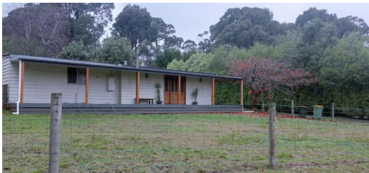
Photograph 1: Existing dwelling to be retained.