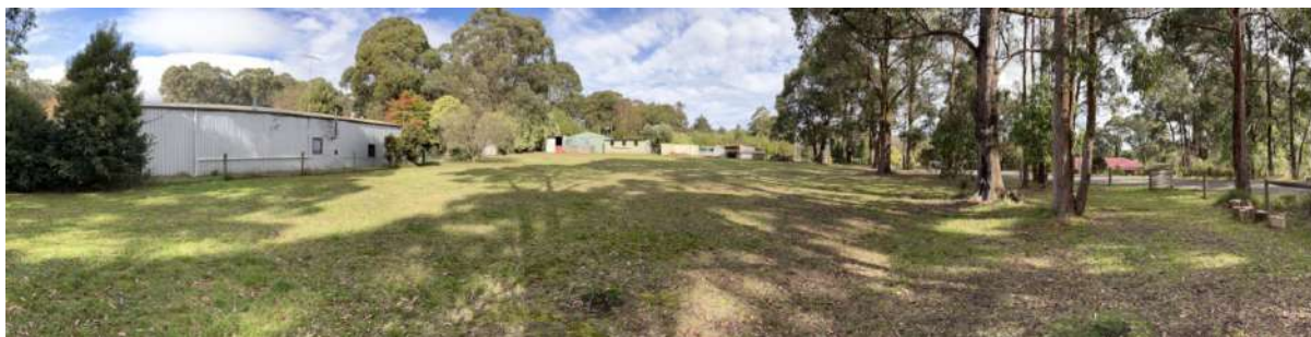
Photograph 5: Panoramic view, looking south across the site from the northern boundary