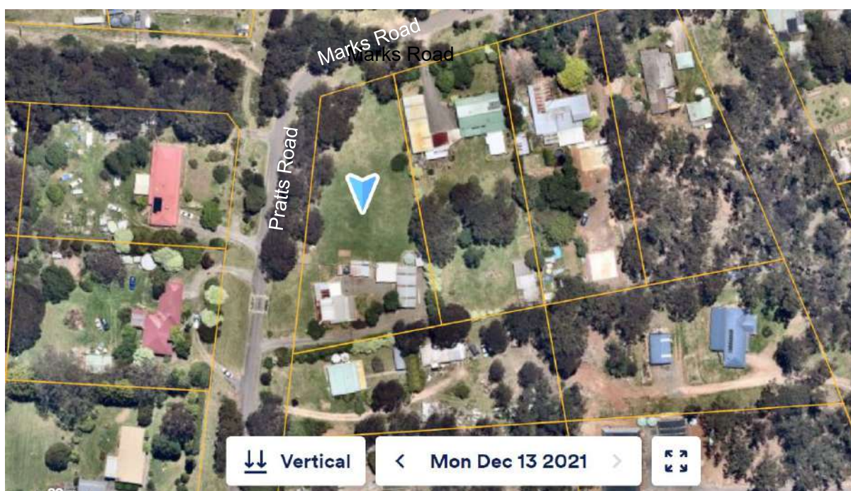
Figure 1: Aerial Image

The land is gently sloping and falls approximately 2.5m from south-east to north-west. Refer to the Site and Context Description (29923P1) for further details.