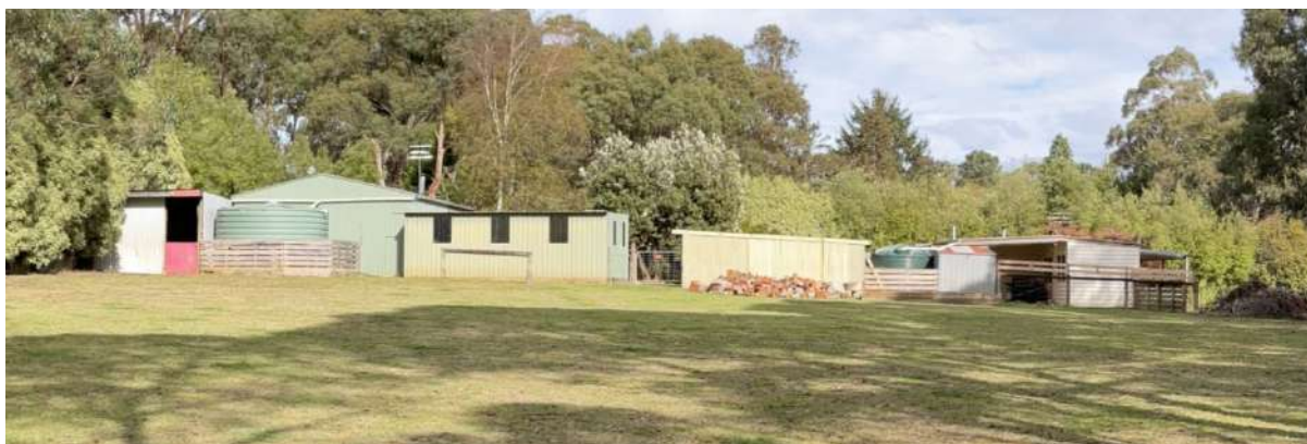
Photograph 4: Looking south across the site at the rear of the existing sheds and dwelling.