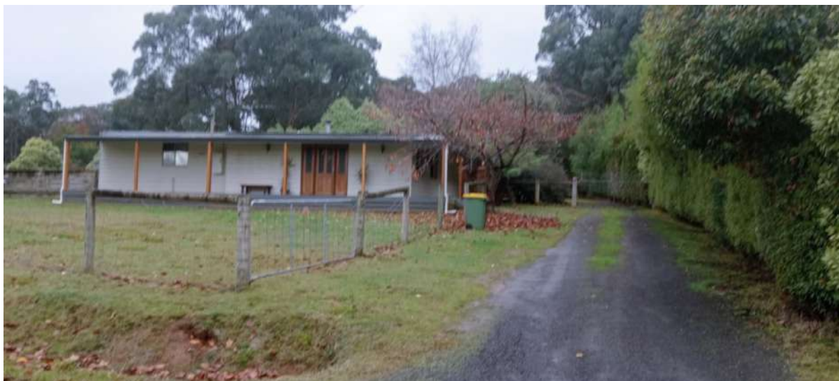
Photograph 2: Existing gravel driveway south of the dwelling