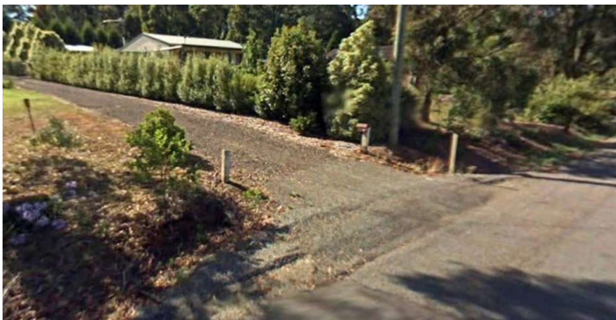
Photograph 3: Existing crossover