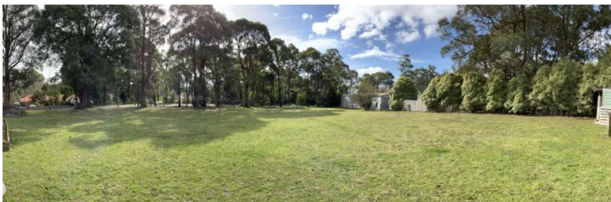
Photograph 6: Panoramic view, looking north across the site from the rear of the sheds.