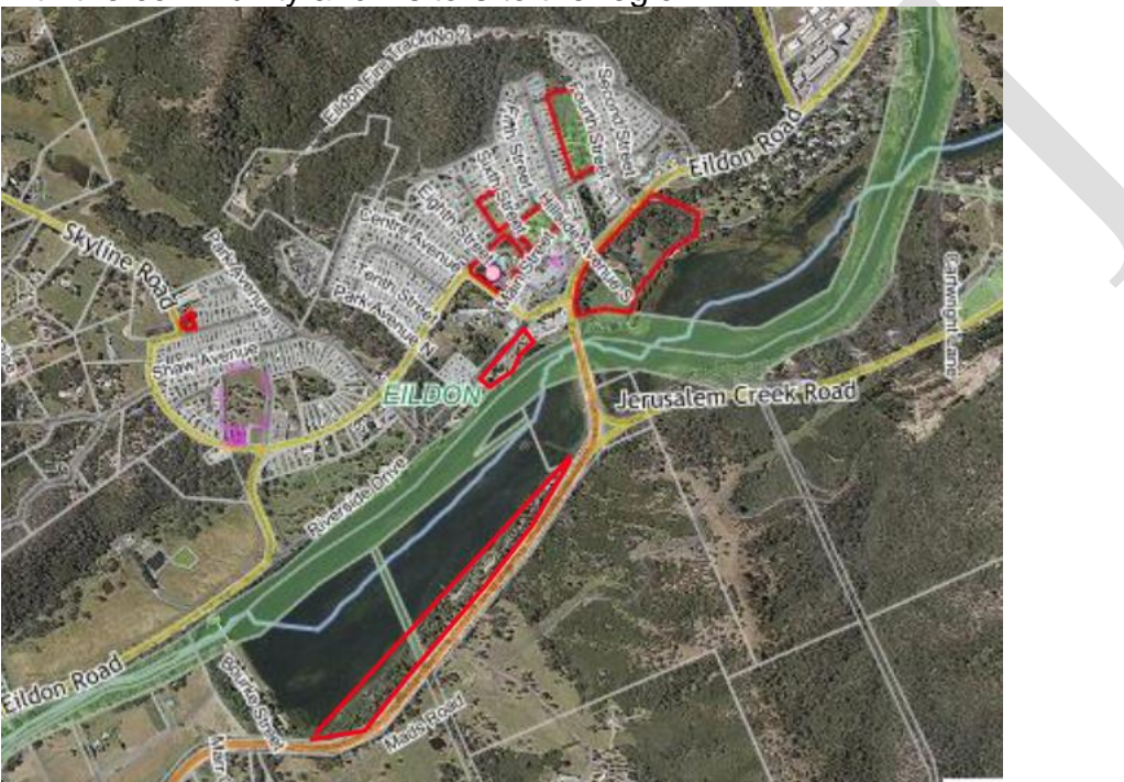
Figure 4 - Public Open Space

The land surrounding the Eildon pondage, which is a body of water used as a regulating pond for the generation of Hydro Electricity, comprising of land surrounding the pondage which is owned in sections by Council or under licence agreement to Council from Goulburn Murray Water. In addition, there are other areas under licence to other authorities which are used for recreational pursuits such as walking, picnicking and fishing. This has been recognised through the recent development of the Eildon Pondage Masterplan, 2023, developed in consultation with the community and visitors to the region.