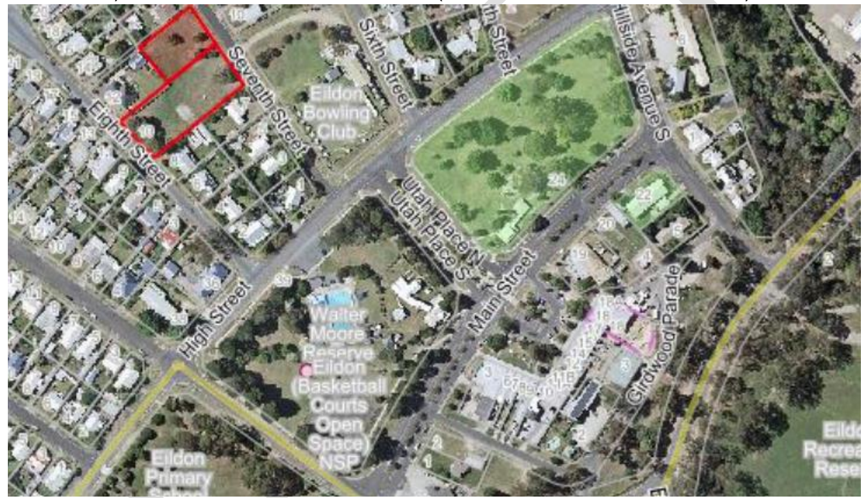
Figure 1 - 10 Eighth Street and 11 Seventh Street, Eildon

The planning permit application applies to 10 Eighth Street, Eildon (Lot 25 on PS041436) and 11 Seventh Street, Eildon (Reserve No.1 on PS506009M)