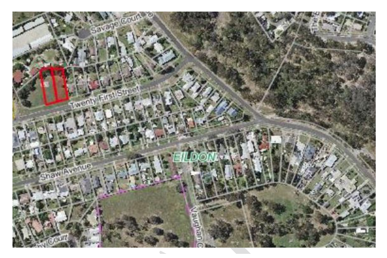
Figure 2 - Lot 1 and Lot 2 - 18 Twenty First Street, Eildon