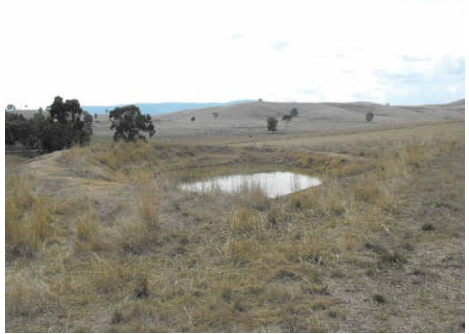
One of the four dams located on the property.