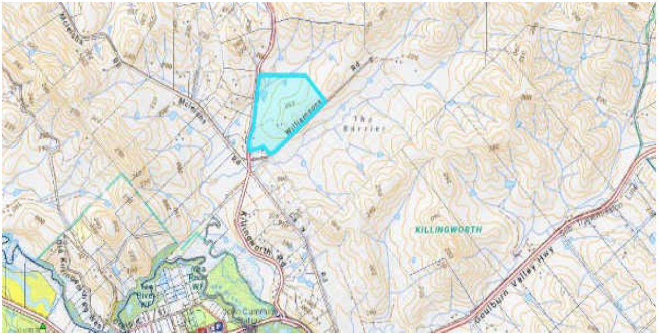
Figure 1: location of the property or study site (the property is shaded in blue)

The purpose VQA was to assess the quality of the vegetation on the study site in accordance with relevant planning and legislative requirements and the Department of Environment, Land, Water and Planning (DELWP) guidelines.