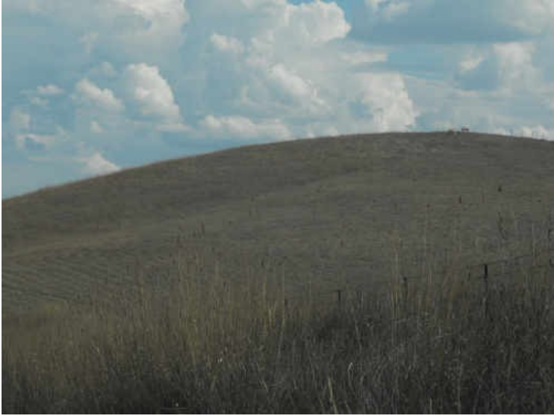
A paddock covered in exotic grasses and forbs