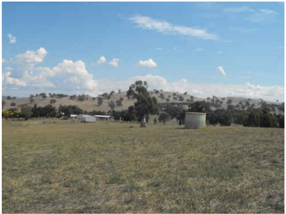
Except for the lone Eucalyptus blakelyi tree the paddock lacks native vegetation.