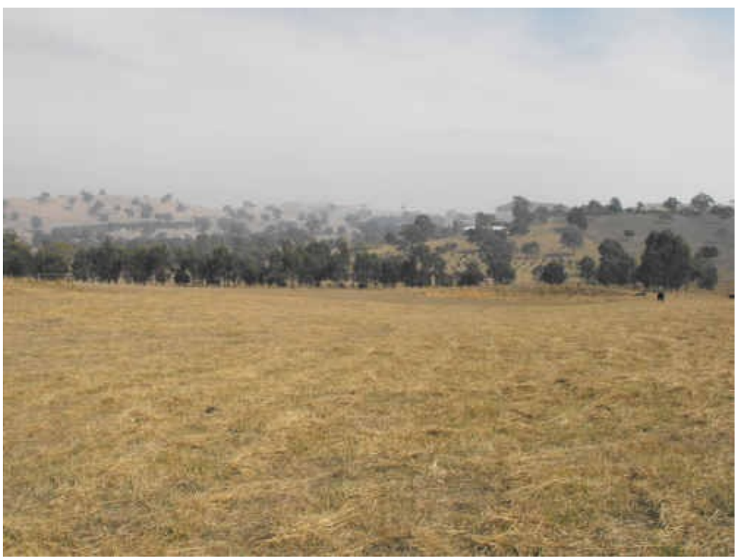
The planted shelter-belt of eucalypts in the background.