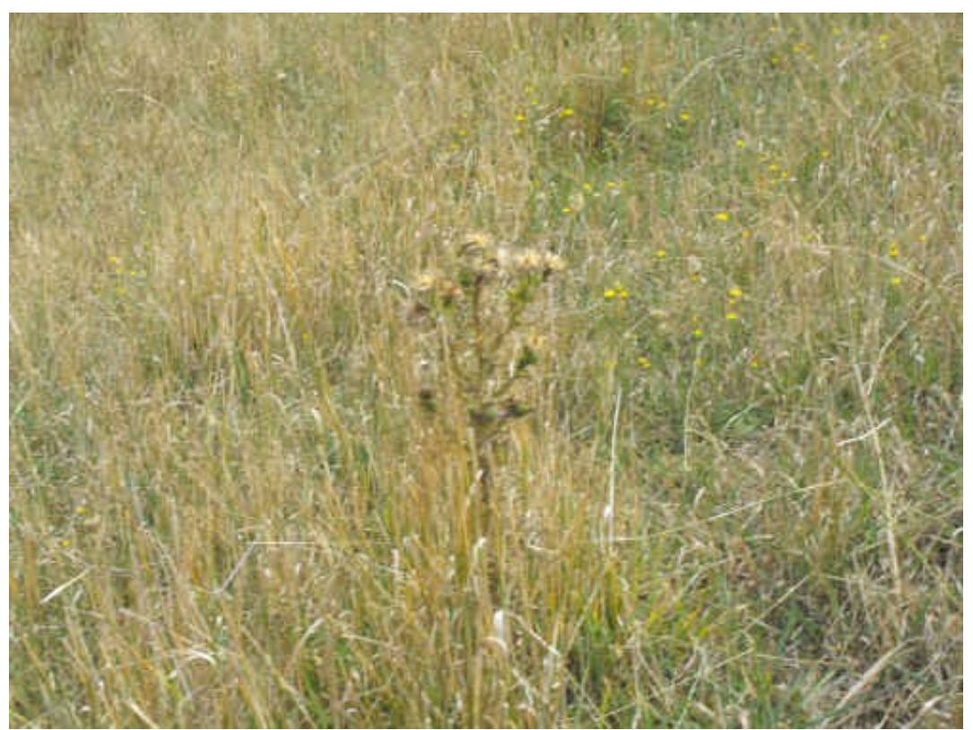
Exotic grass and forbs of the pasture community.