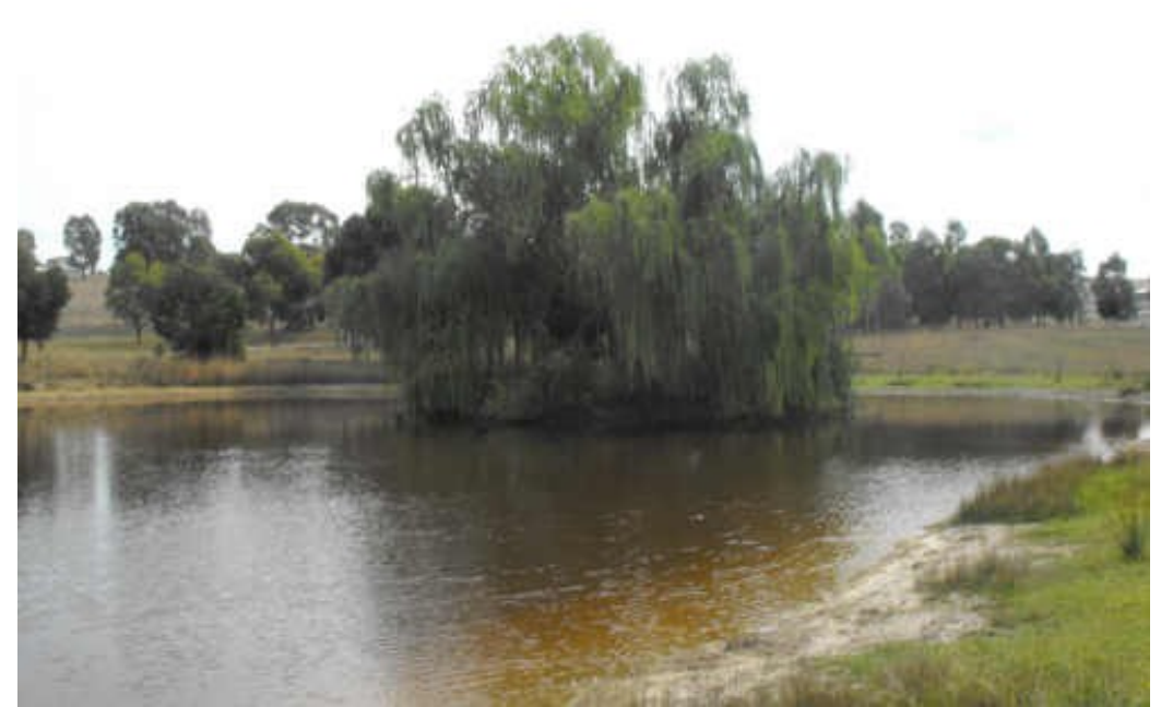
The fenced-off dam.