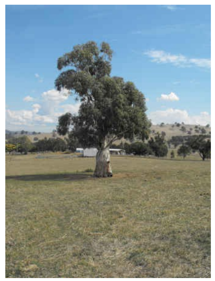
A large old Eucalyptus blakelyi tree, which will not be removed.