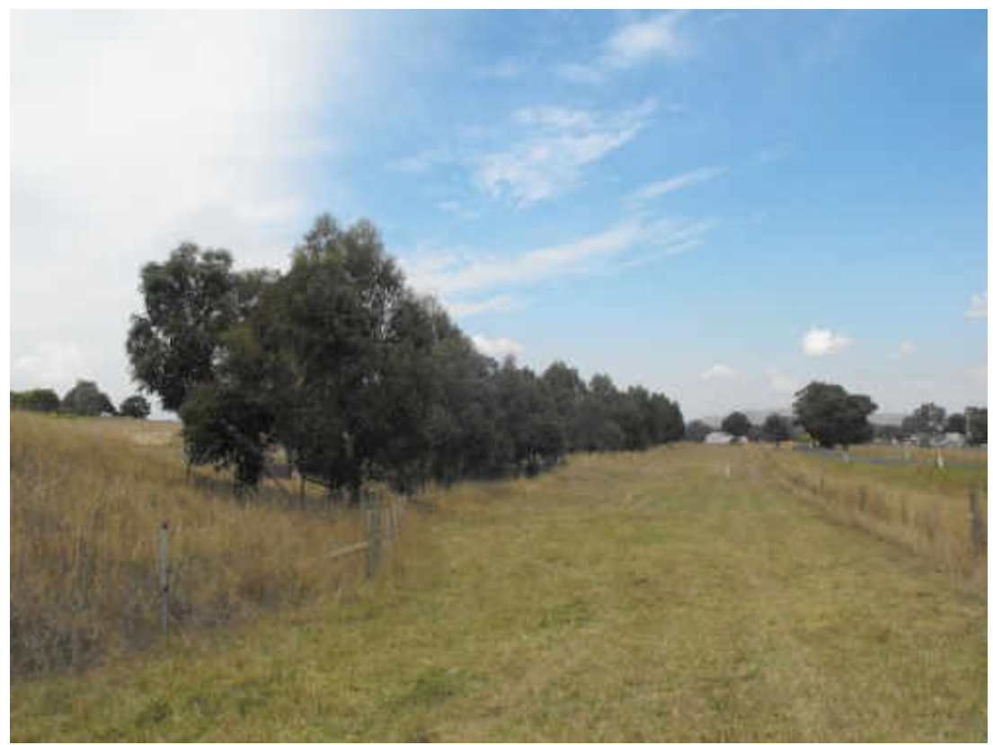
The planted shelter-belt of Eucalyptus trees and shrubs.