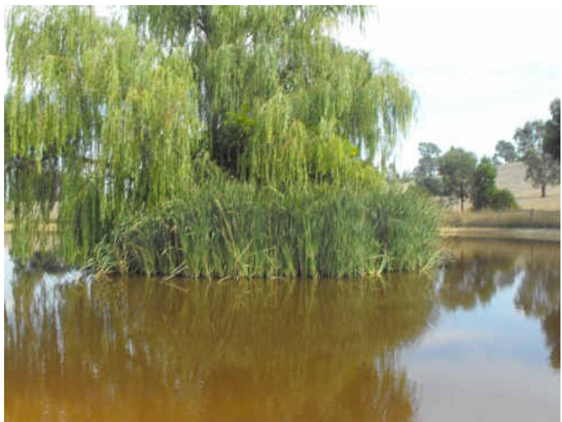
The fenced-off dam with a Willow and patch of Typha .

Appendix 2: Photographs taken on 28.3.2022