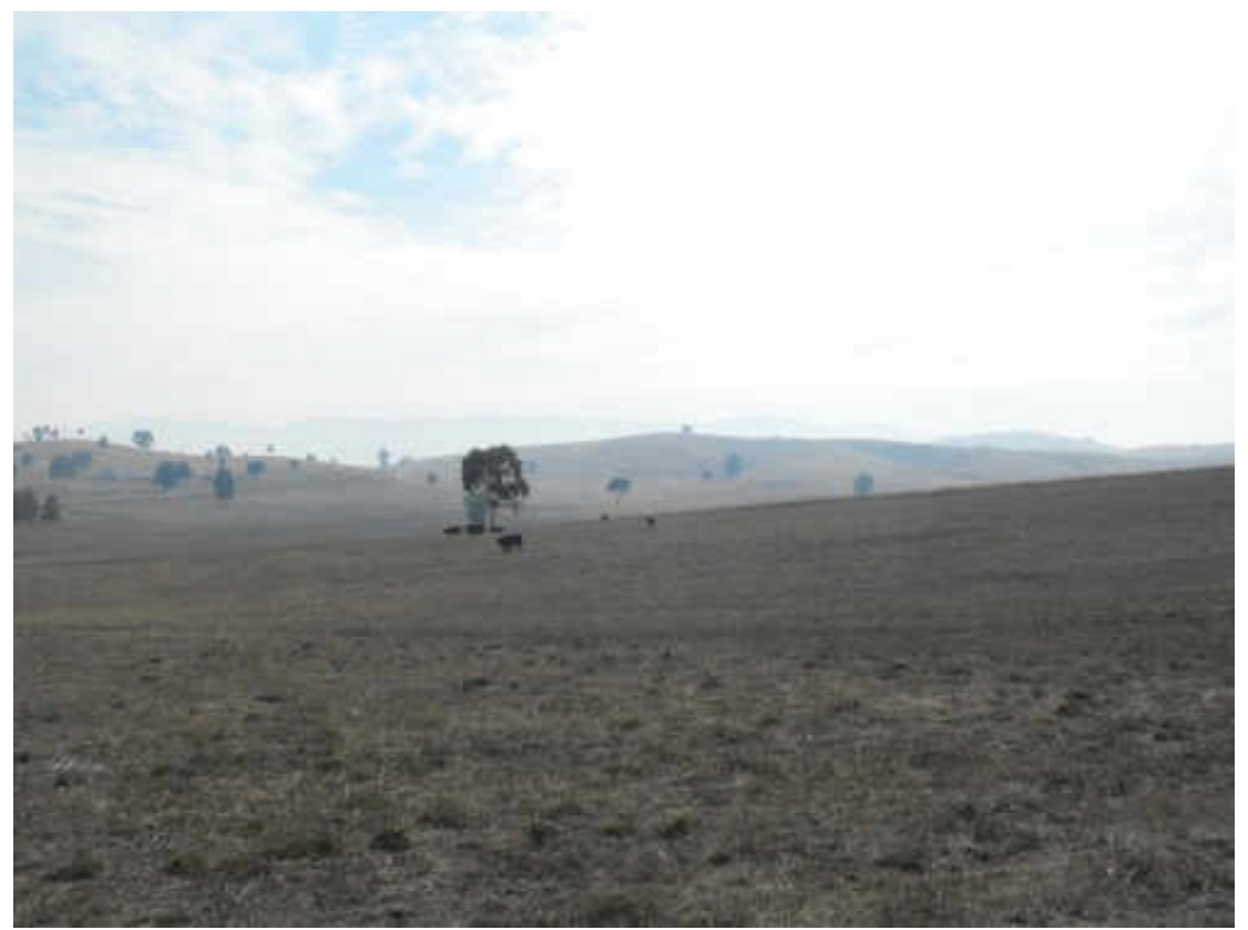
Looking across a grazed paddock with an isolated small Eucalyptus tree.