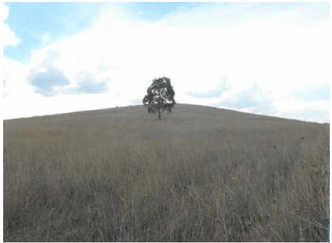
A small eucalypt in exotic pasture paddock.