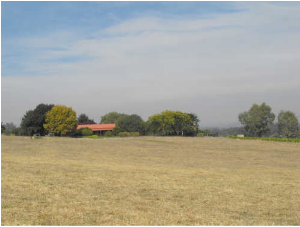
The existing house on the property.