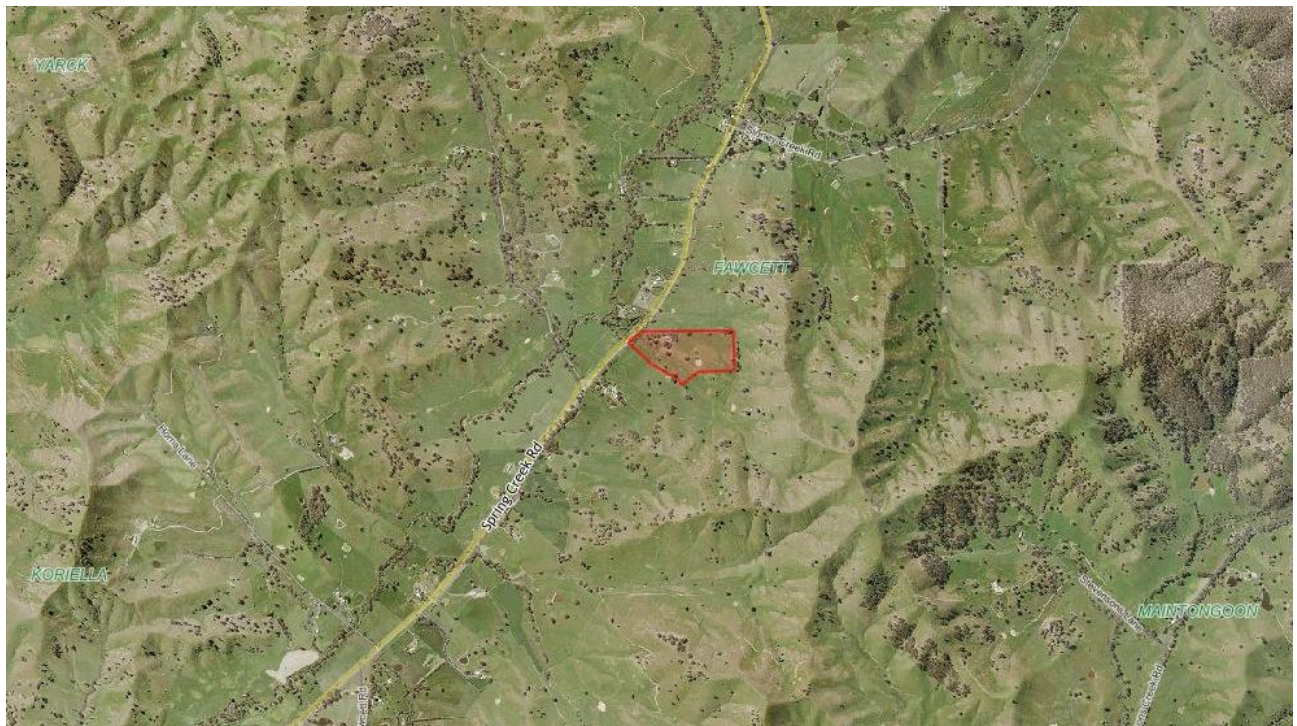
Figure 1 – subject site highlighted in red.