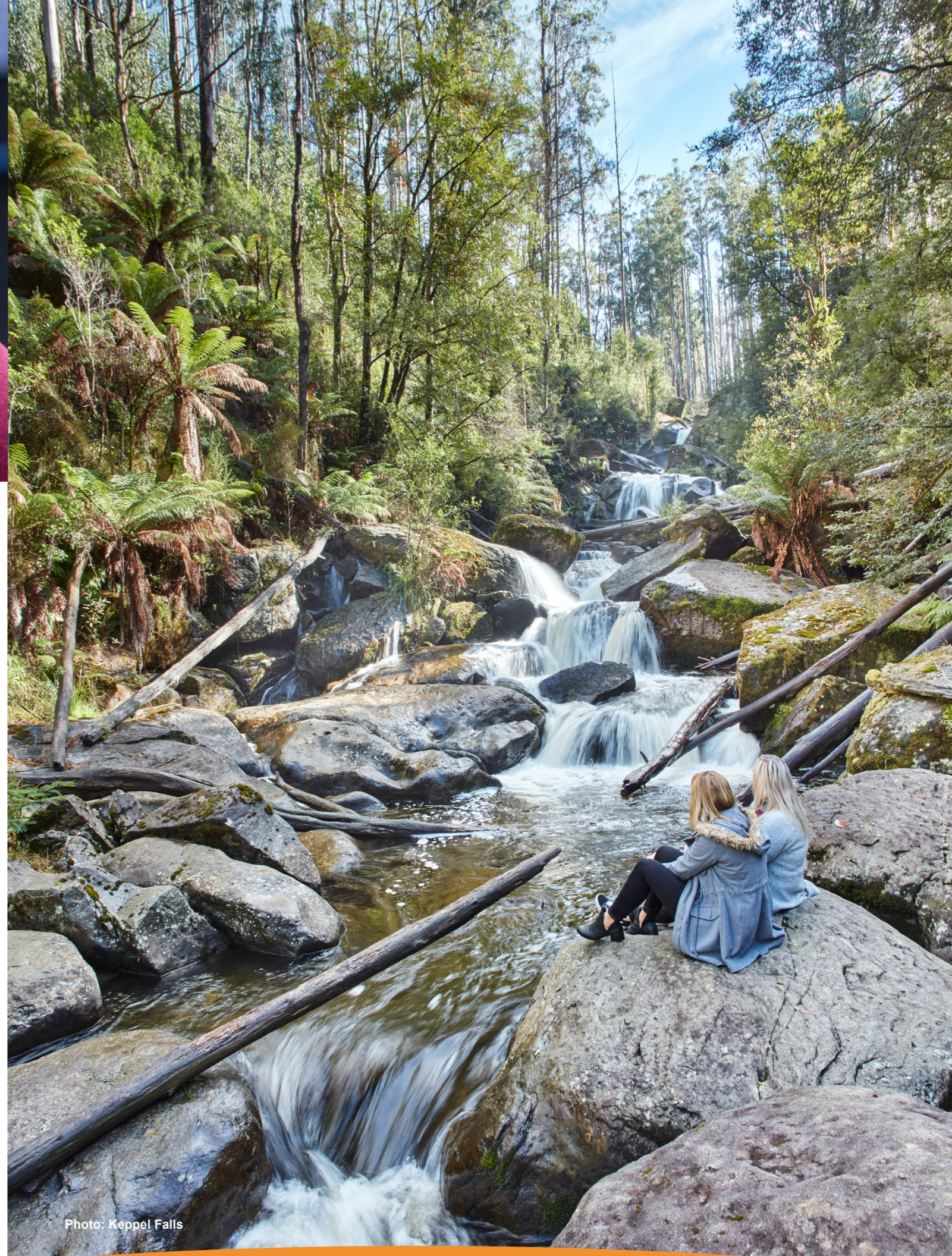
Photo: Keppel Falls

Another useful link for information about Aged Care Services is www.myagedcare.gov.au