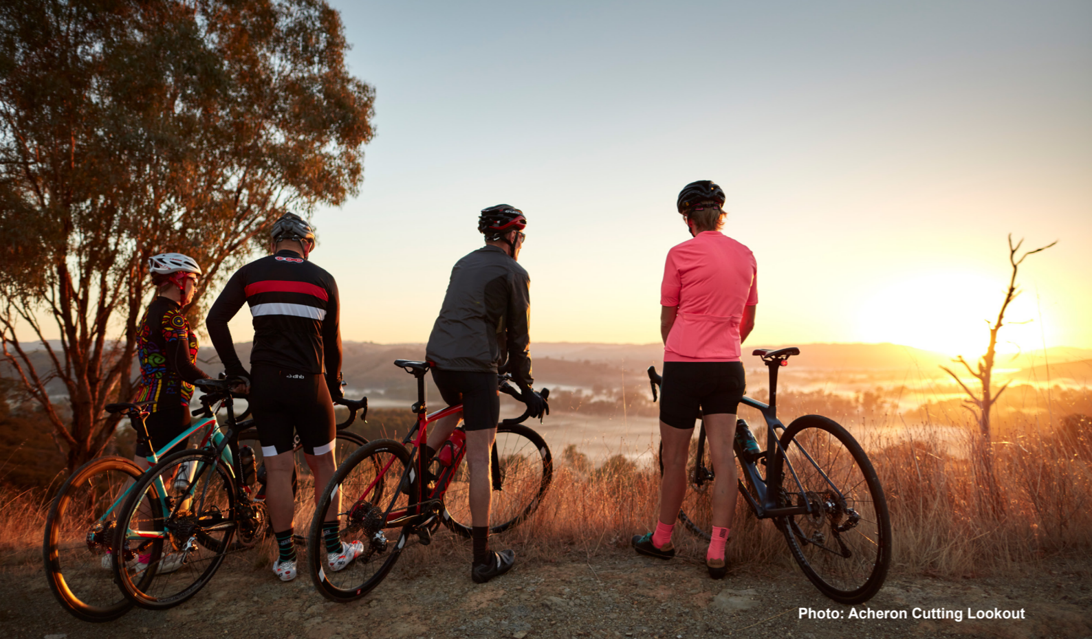
Photo: Acheron Cutting Lookout