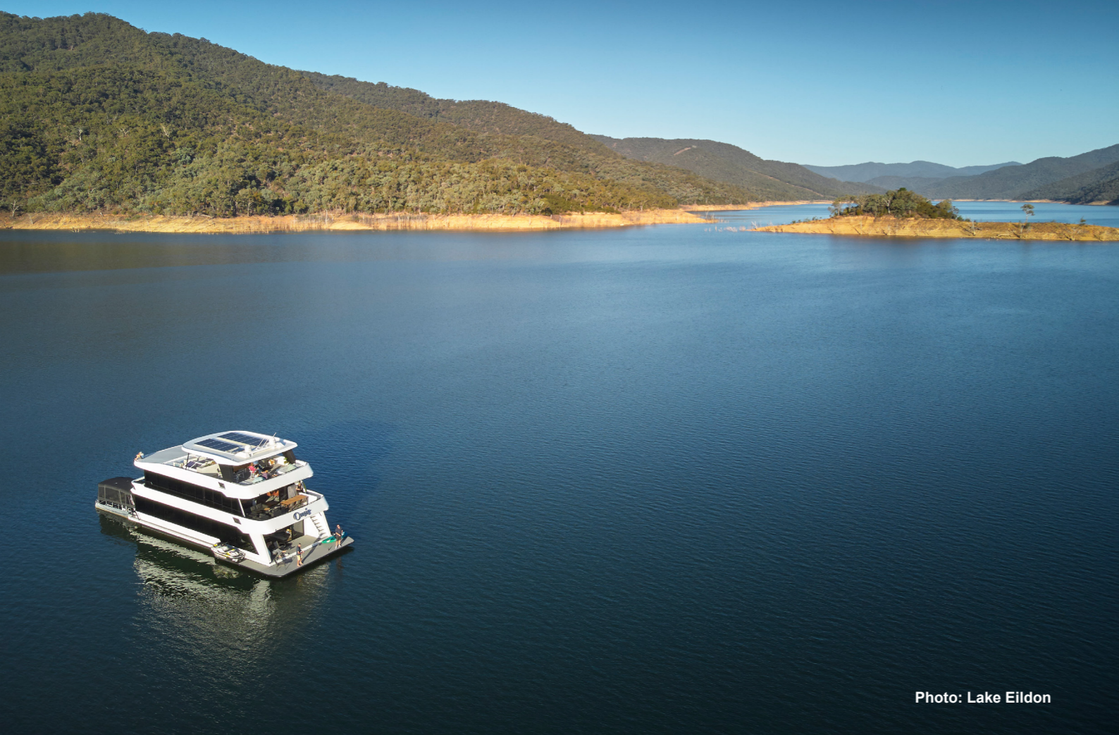
Photo: Lake Eildon