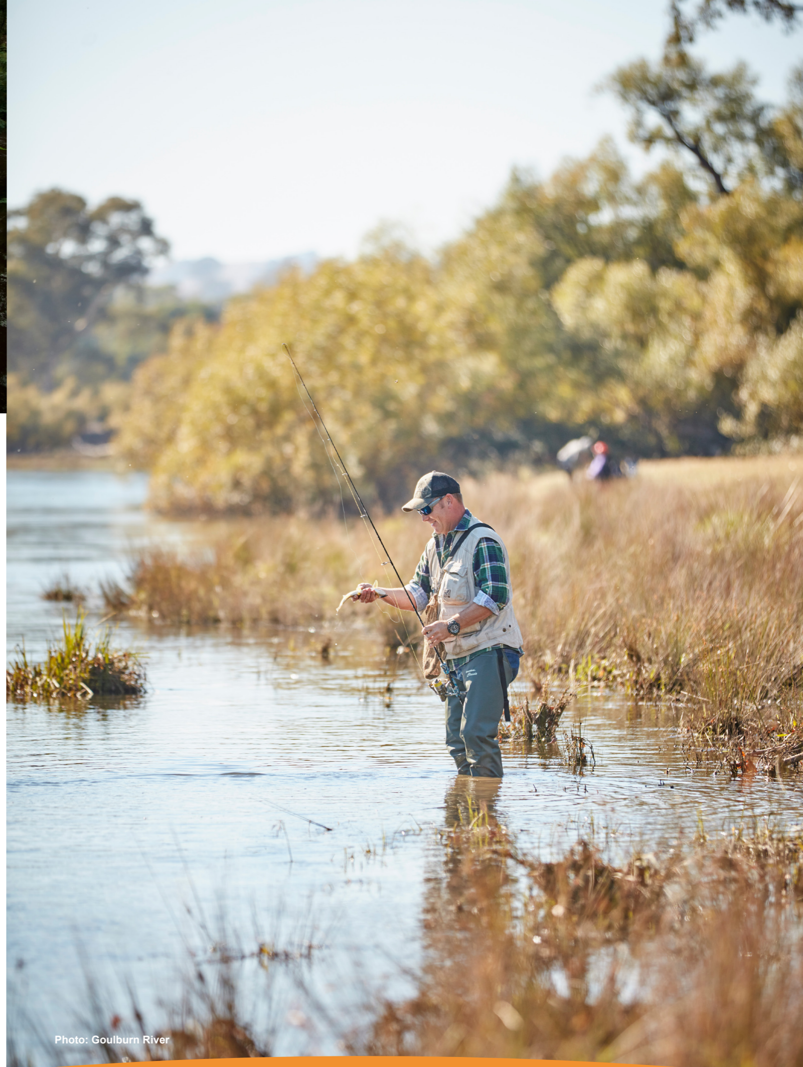
Photo: Goulburn River

If you'd like to learn more about our Plan and Council's priorities for services and work across the Shire for 2021-2025, download a copy at www.murrindindi.vic.gov.au/councilplan , or contact Council.